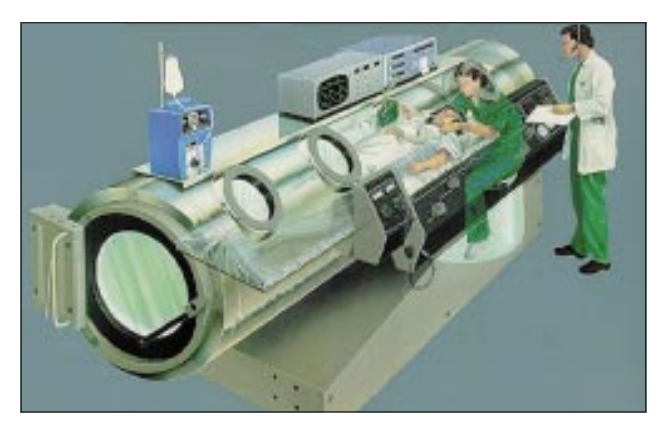
Monoplace hyperbaric chamber