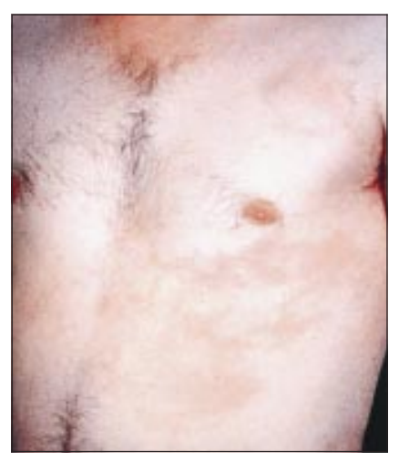
Rash due to decompression illness

Hyperbaric oxygen is also claimed to be helpful in refractory osteomyelitis. Animal experiments show improved healing of osteomyelitis compared with no treatment, but the effect is no better than that with antibiotics alone and the two treatments have no synergistic effect. Uncontrolled trials of surgery and antibiotics combined with hyperbaric oxygen in refractory osteomyelitis have reported success rates of as high as 85%, but controlled trials are needed.