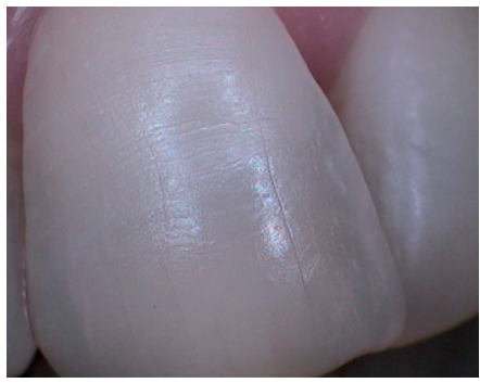
Fig. 2 Right maxillary central incisor showing the rough surface texture of the tooth following the application of the chlorine dioxide

Bleaching efficacy can be influenced by patient factors (for example, age, gender and initial tooth colour), the bleaching material used (for example, type of peroxide compound, peroxide concentration and other ingredients), and application method (for example, contact time, application frequency, enamel prophylaxis before bleaching treatment). These factors not only contribute to the bleaching