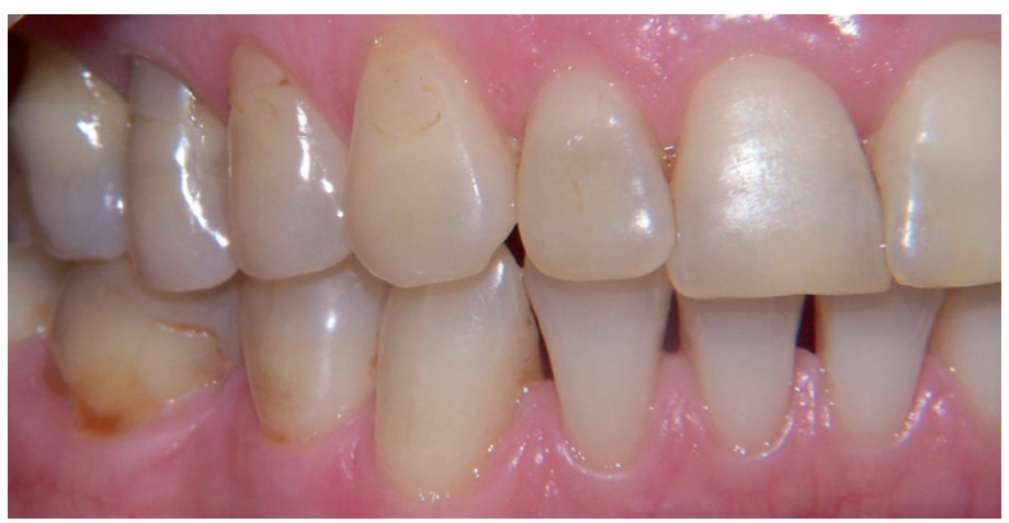
Fig. 1 Right side of maxillary teeth of a patient who had teeth whitened on a cruise using chlorine dioxide based materials

While tooth bleaching has become popular and millions of people have received the treatment during the last two decades, the mechanisms of tooth bleaching remain yet to be fully understood.<sup>6,10</sup> The