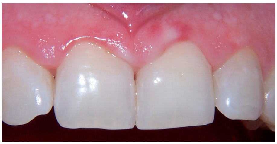
Fig. 3 Tissue burn which the patient experienced as a result of the contact of gel to gingival tissue during the power bleaching procedure

there were safety concerns with potential systemic adverse effects if the bleaching gel were to be ingested as well as local adverse effects on enamel, pulp and gingiva because of the direct contact of the gel with the tissues.<sup>4,17-19</sup> The safety controversies over the peroxide-based tooth bleaching prompted not only scientific deliberations but also legal challenges to their use in dentistry.<sup>4,6,18-20</sup>